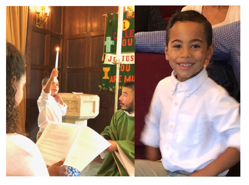
Soli Deo Gloria!