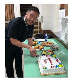
Noah's Ark September 2018