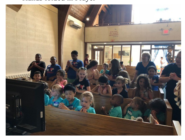
Kids thankful for Jesus and VBS