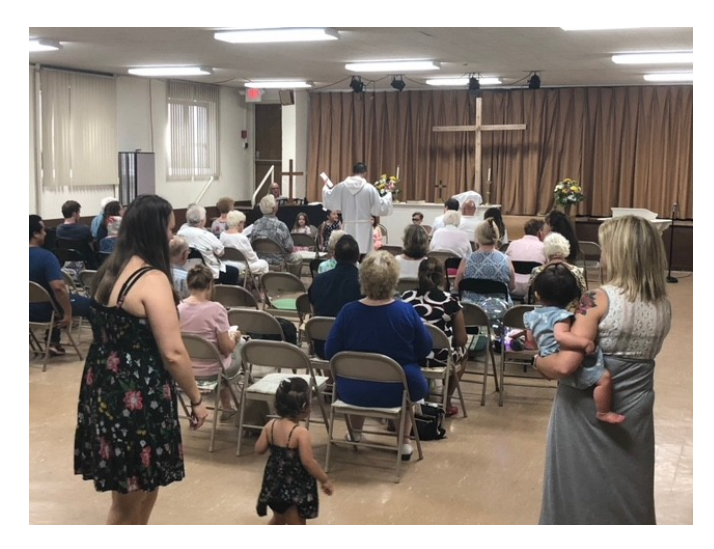
Worship in the undercroft during renovations on July 1st