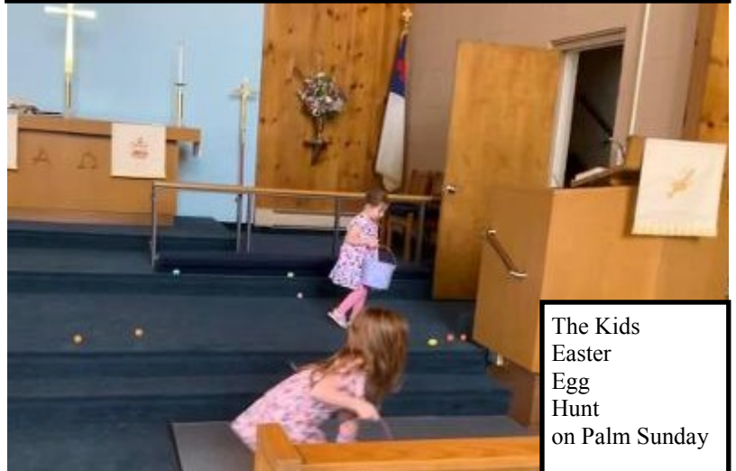
The Kids Easter Egg Hunt on Palm Sunday