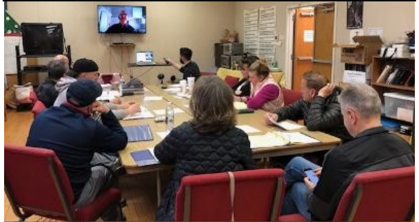
Church Council video-conferencing for new church program

Father, use my hands to help, my feet to go, my voice to tell, my heart to love others as you have first loved me; but more importantly, help me to first love You—in Jesus' name for all the glory is His, Amen.