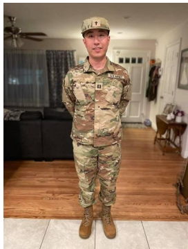
Travis Phase I Chaplaincy